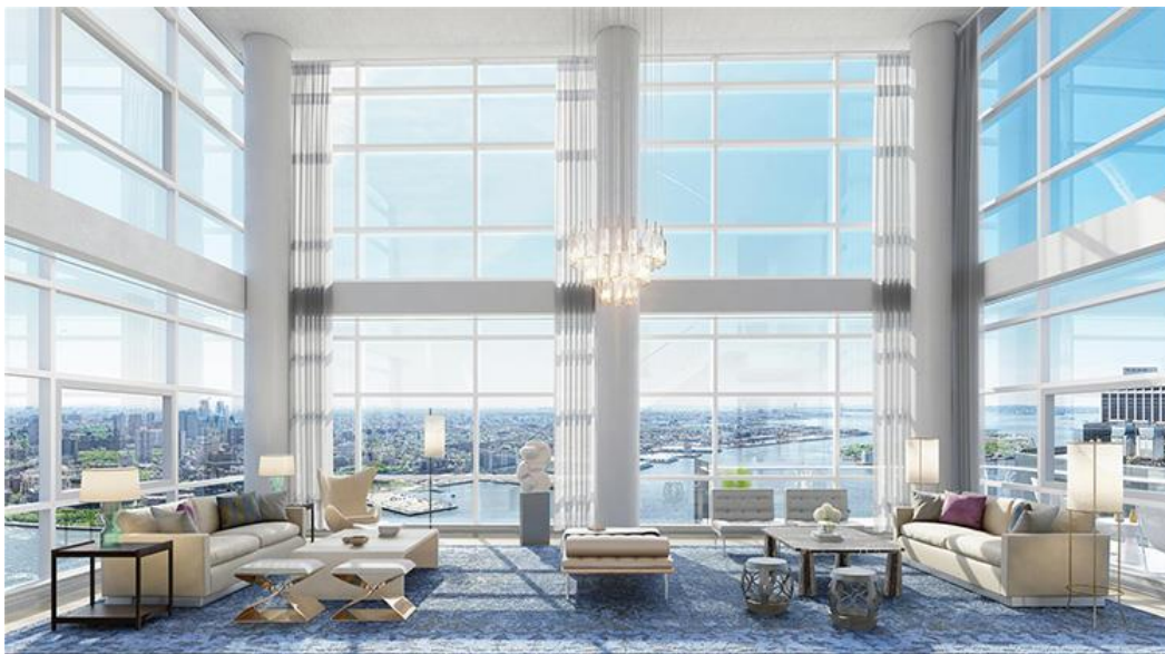
161 Maiden Lane #PH1