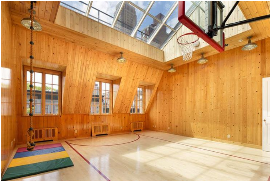
427 East 85th Street

swanky hotel location, it comes with access to a 24-hour concierge, a 40,000 square-foot fitness facility, a 75-foot swimming pool and The Mandarin Spa.