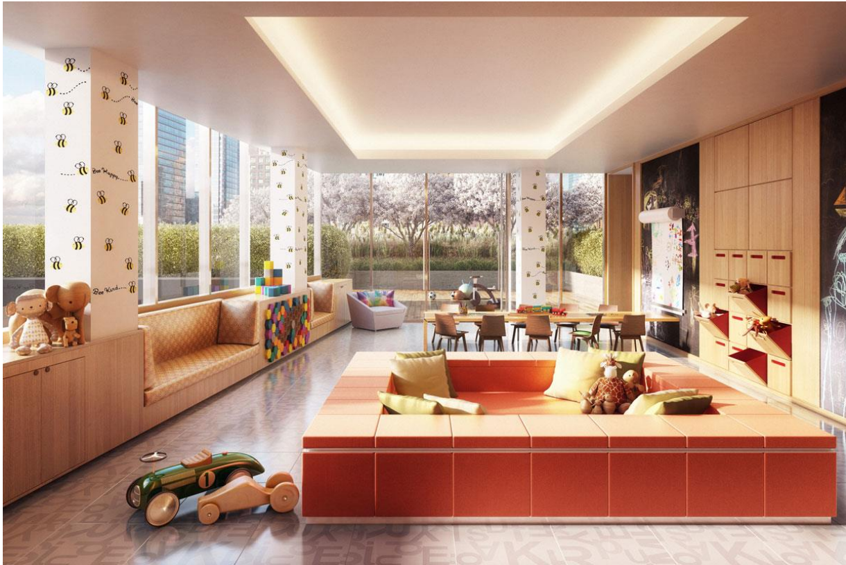
A rendering of the playroom at One West End on the Upper West Side DBOX

One West End , developed by Elad Group and Silverstein Properties, offers multiple spaces for children and teenagers and robust programming by a dedicated concierge specializing in coordinating unique activities for kids and families. Highlights include a customized play area for younger children, complete with plush upholstery and a beehive-inspired centerpiece, to spaces for swimming, movies and sports screenings, studying and parties for tweens and teens. A dedicated concierge will offer a-la-carte services including party planning, tutoring, cooking classes and lessons that can be booked at any time. Construction is expected to be completed in the first quarter of 2017, with prices ranging from $3 million to over $20 million.