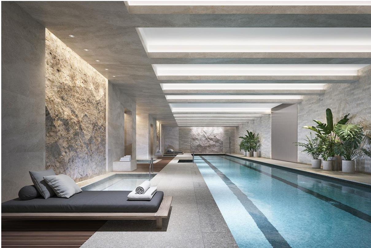
A rendering of the swimming pools at 70 Vestry

The children of supermodel Gisele Bündchen and New England Patriots quarterback Tom Brady will no doubt be enjoying the children's pool at 70 Vestry , as the couple just paid $20 million for a five-bedroom, 5,000-square-foot-home in the Robert A.M. Stern-designed building. The condominium, due for completion in 2018, stands along Hudson River Park and has a half-size Olympic swimming pool and a children's pool. It also has a 1,250-square-foot children's playroom called The Block, which will feature an art area, a climbing structure, a slide, a magnetic wall and a farmers market. The residences currently advertised range in price from $7.25 million to $29.5 million, but do not include the two penthouses.