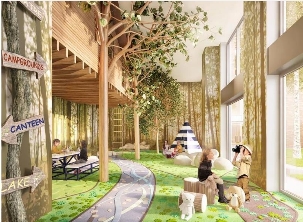
A rendering of the kids' playroom at The Kent on Manhattan's Upper East Side.