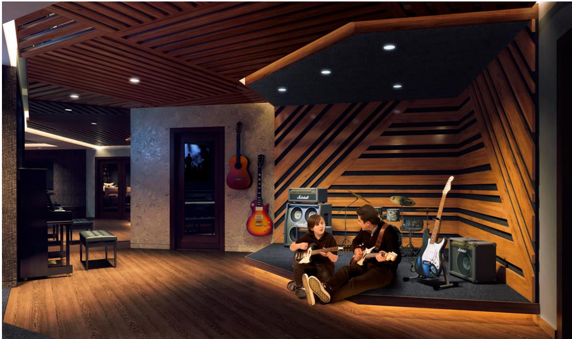
The Kent's music room Williams New York

The Kent , developed by Extell, is a collection of 83 condos located in Manhattan's private school mecca, the Upper East Side. The area has long been considered among the best neighborhoods for families because of its proximity to high-performing schools, parks and world-class cultural institutions. The amenities package at The Kent also speaks to families, from the stroller valet to the indoor/outdoor children's playroom, aptly named Camp Kent, which has a huge treehouse. For older kids, there's a Lenny Kravitz-designed Sound Lounge multimedia room. It will be completed in 2017, with residences ranging from $2.45 million to $19.5 million.